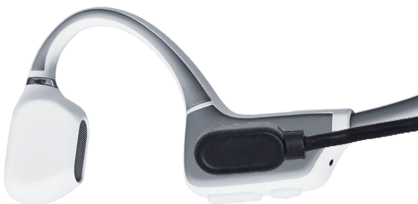
Figure 1: Charging dock connection orientation

Only use the supplied magnetic charging dock, ensuring the correct orientation as shown below. During charging, the LED indicator will be red, and the headphones will automatically power off. Once charging is complete, the LED will change to blue.